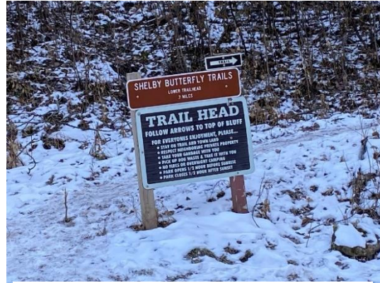
Shelby Butterfly Trails Trailhead