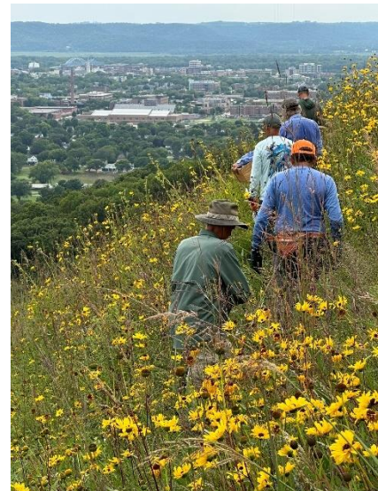
Setting Live Traps to Monitor Mice & Voles on Lookout Prairie, August