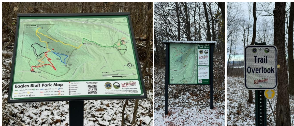
Photos from La Crescent's Park System