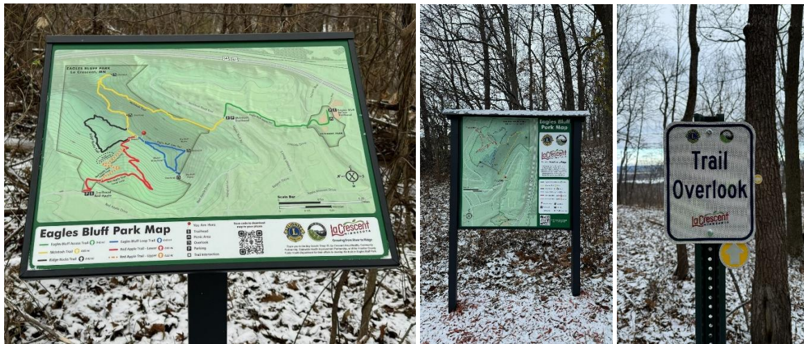
Photos from La Crescent's Park System