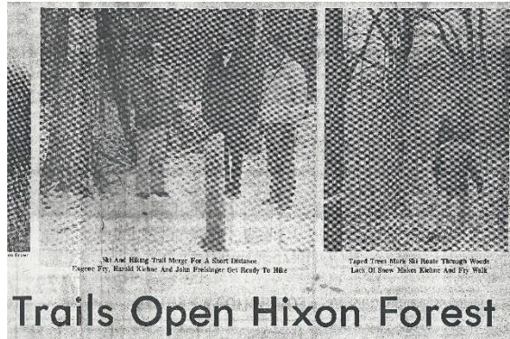
From a 1975 La Crosse Tribune Article